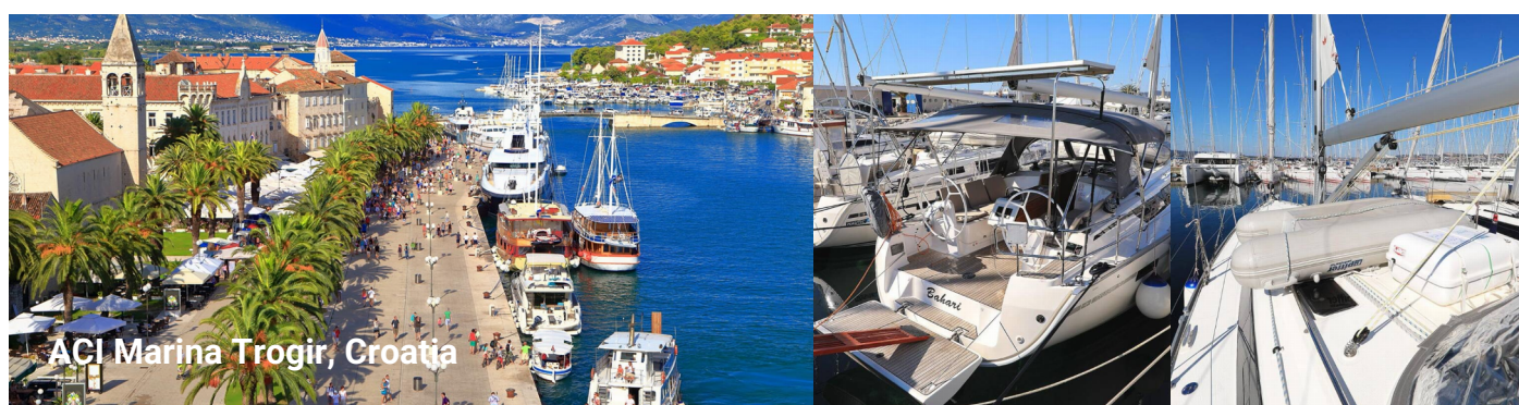
ACI Marina Trogir, Croatia