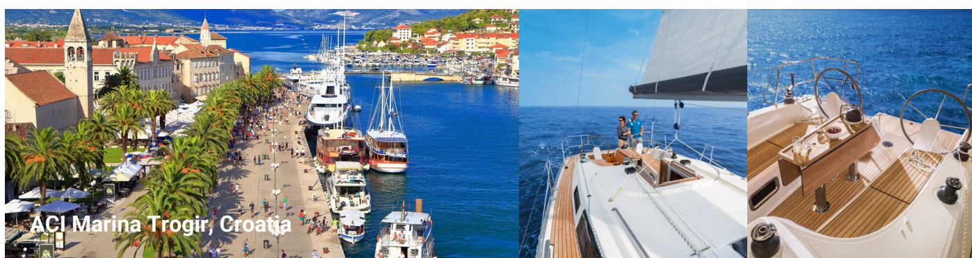
ACI Marina Trogir, Croatia