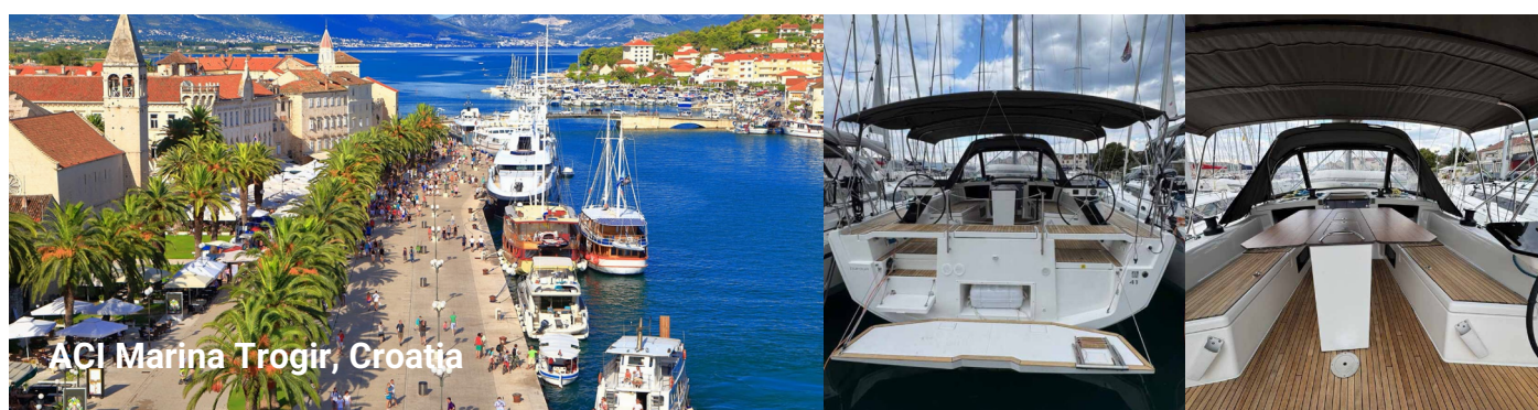
ACI Marina Trogir, Croatia