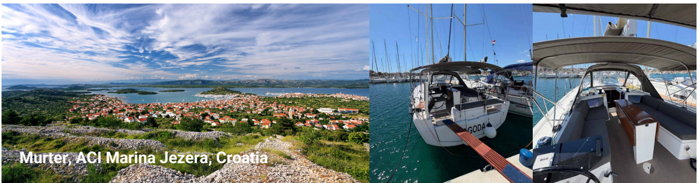
Murter, ACI Marina Jezera, Croatia