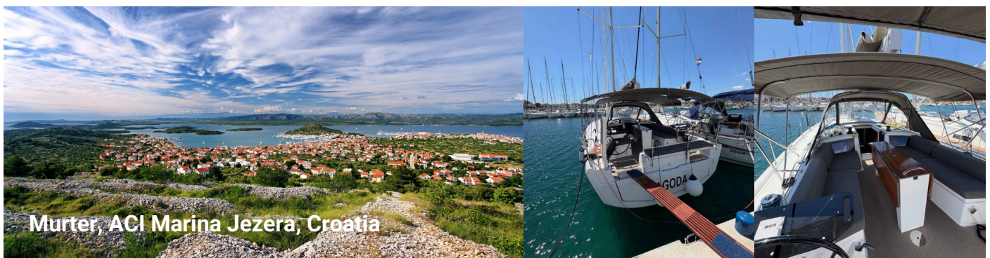
Murter, ACI Marina Jezera, Croatia