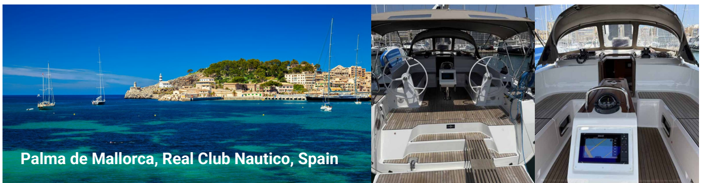
Palma de Mallorca, Real Club Nautico, Spain