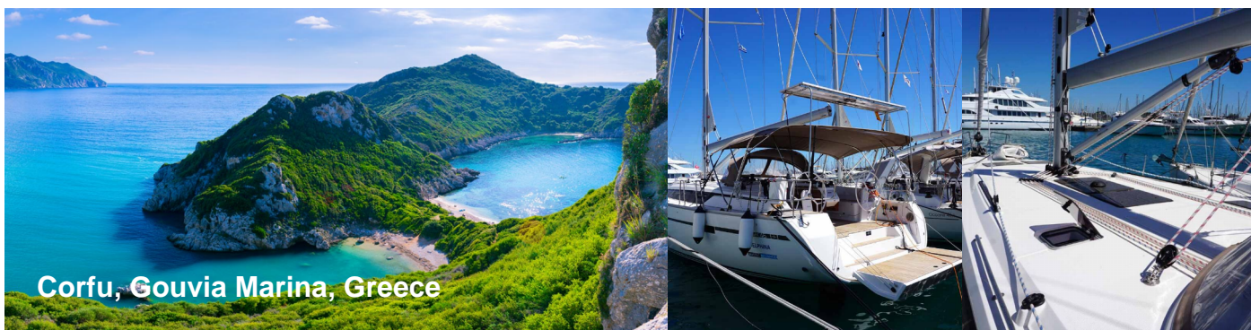
Corfu, Gouvia Marina, Greece