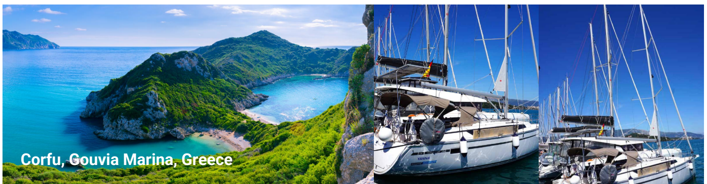
Corfu, Gouvia Marina, Greece