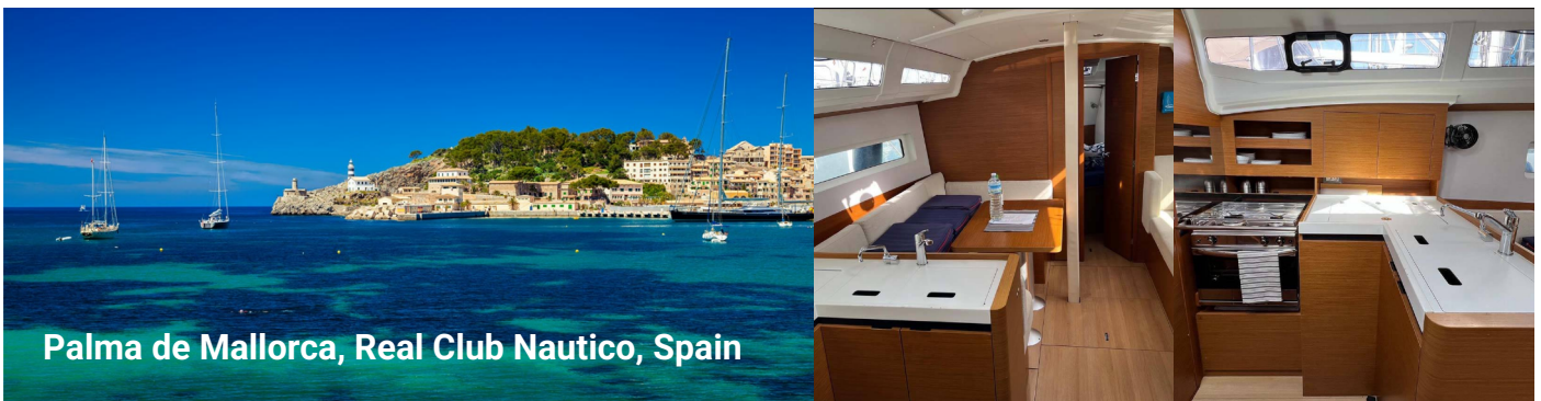
Palma de Mallorca, Real Club Nautico, Spain