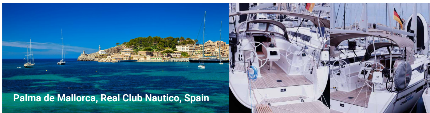
Palma de Mallorca, Real Club Nautico, Spain