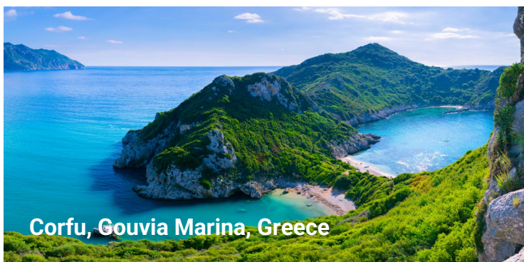
Corfu, Gouvia Marina, Greece