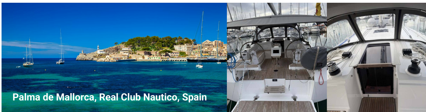
Palma de Mallorca, Real Club Nautico, Spain