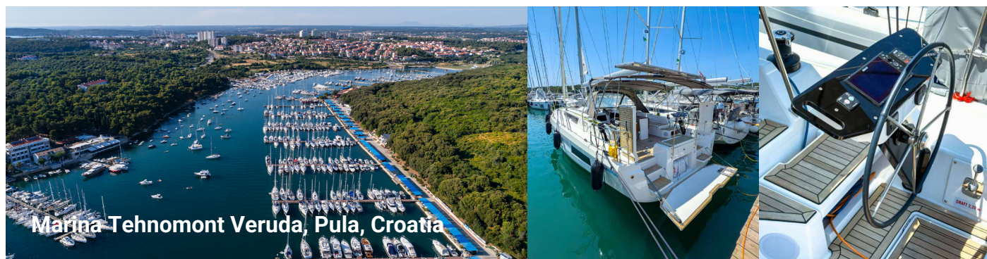
Marina Tehnomont Veruda, Pula, Croatia