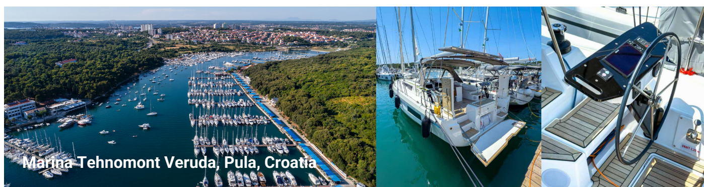
Marina Tehnomont Veruda, Pula, Croatia