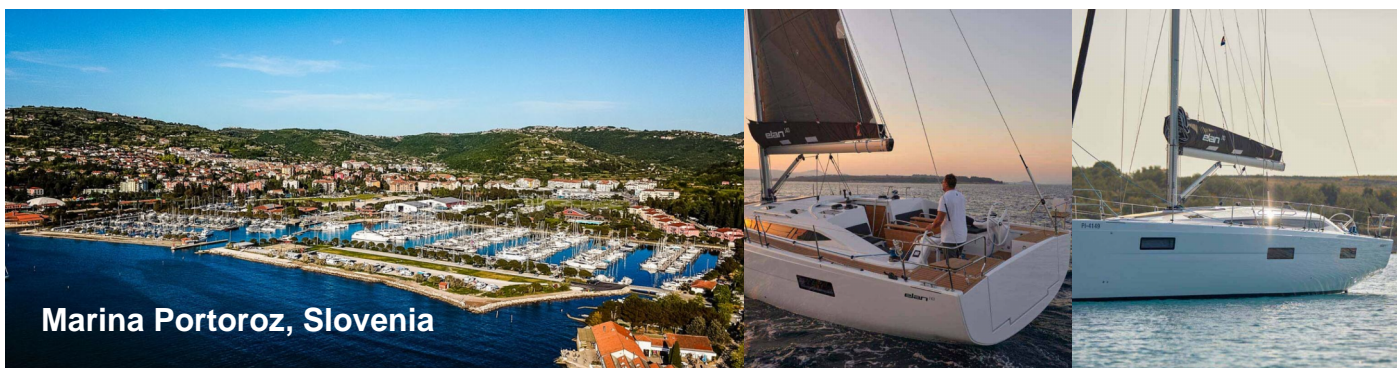
Marina Portoroz, Slovenia