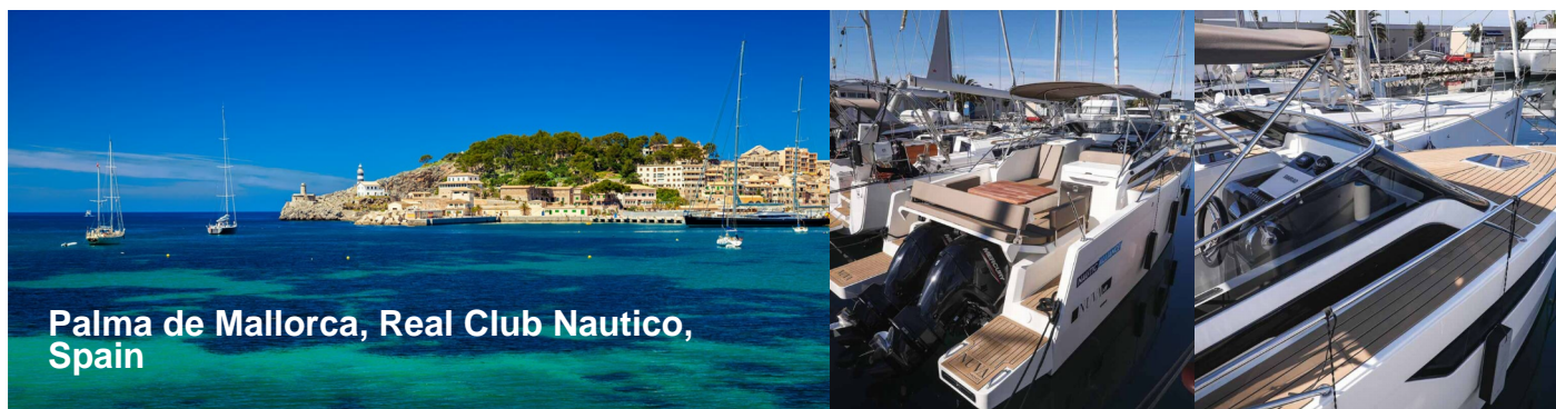
Palma de Mallorca, Real Club Nautico, Spain