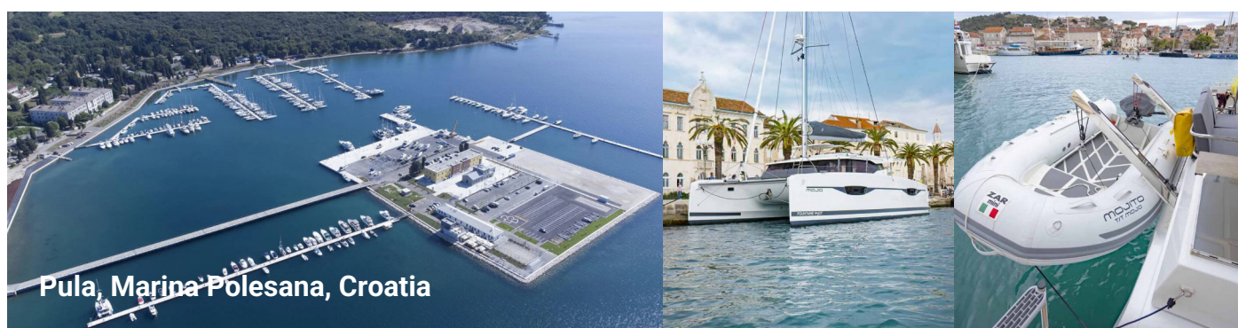
Pula, Marina Polesana, Croatia