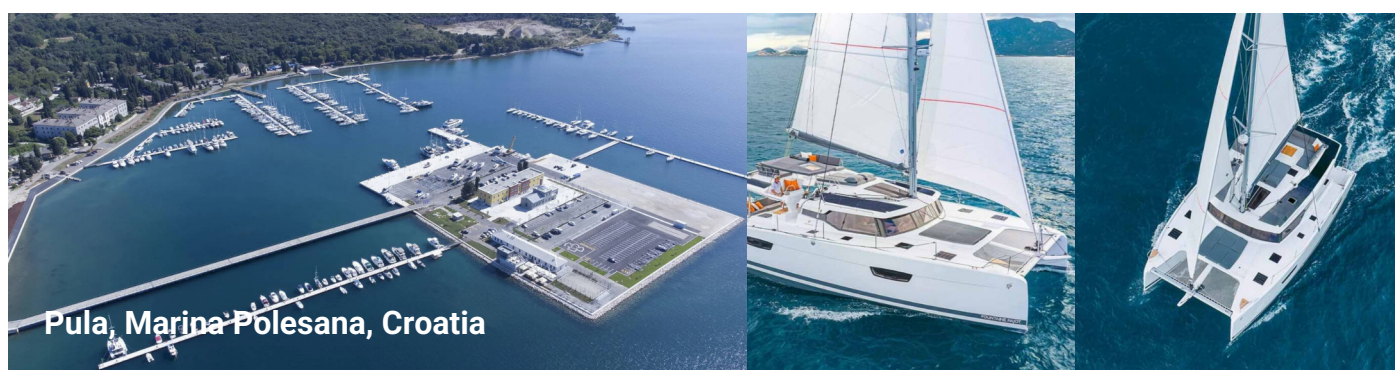
Pula, Marina Polesana, Croatia