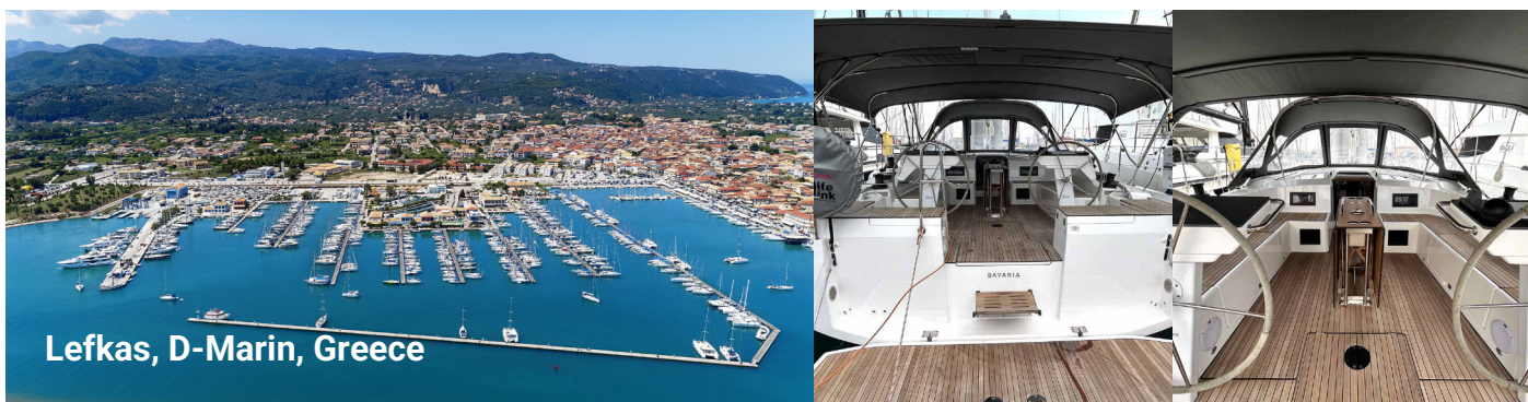
Lefkas, D-Marin, Greece