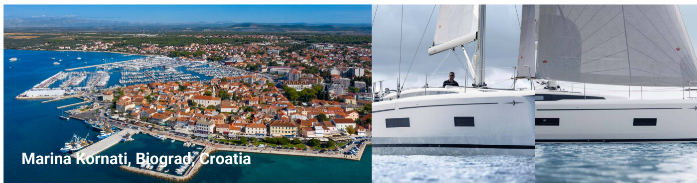
Marina Kornati, Biograd Croatia