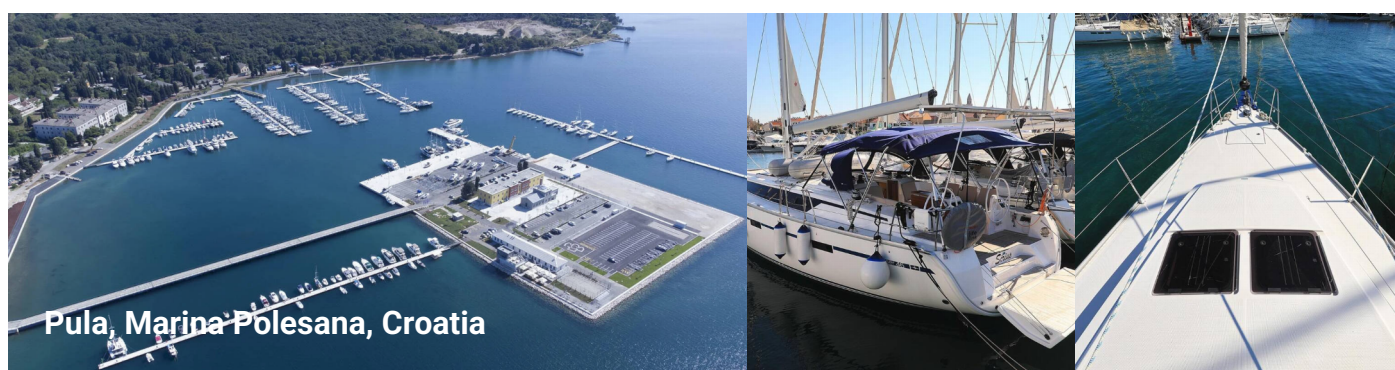
Pula, Marina Polesana, Croatia