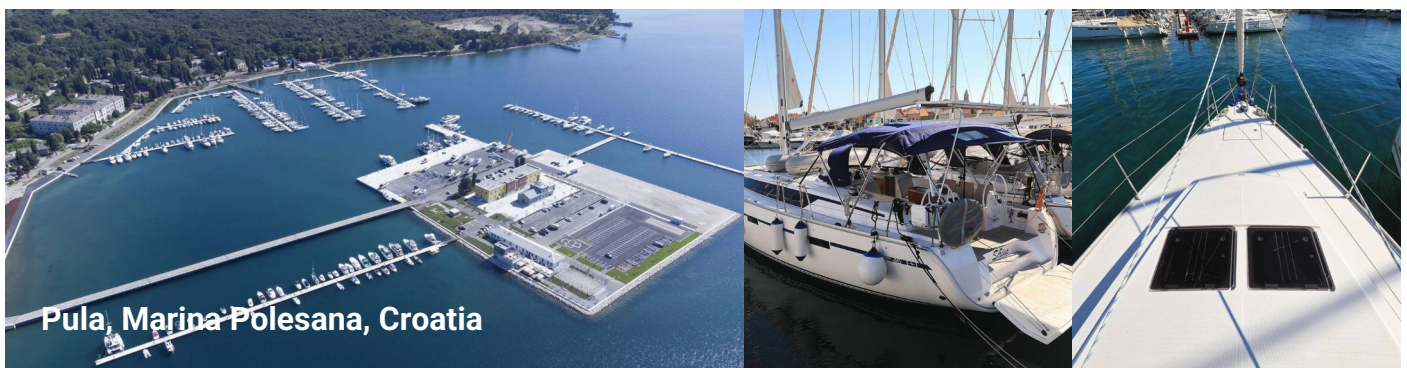
Pula, Marina Polesana, Croatia