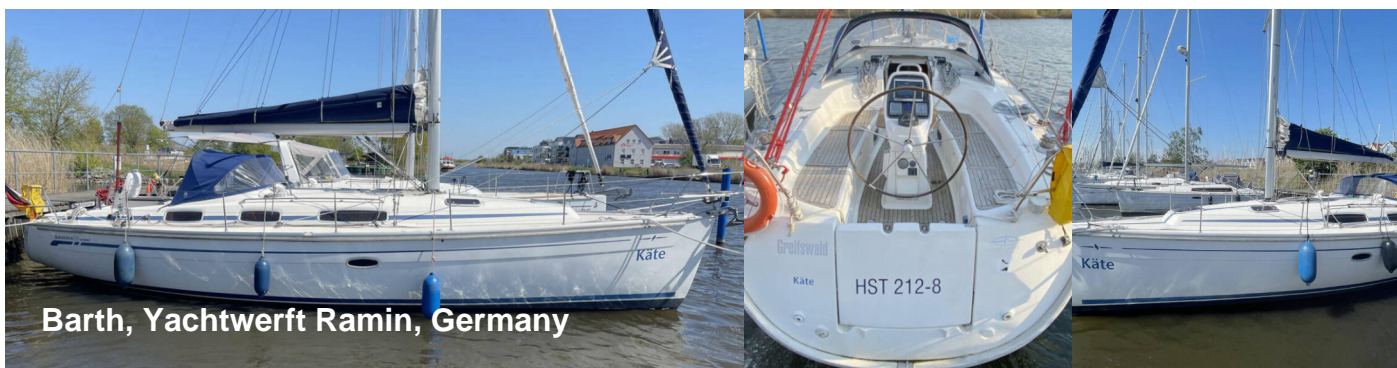
Barth, Yachtwerft Ramin, Germany