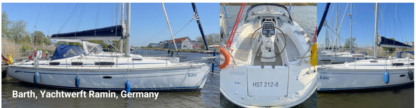
Barth, Yachtwerft Ramin, Germany