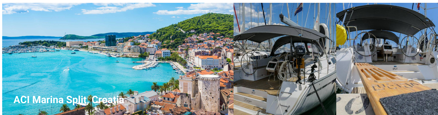
ACI Marina Split Croatia