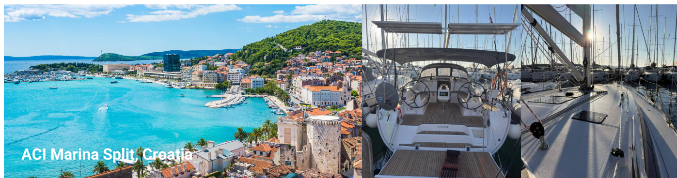
ACI Marina Split Croatia