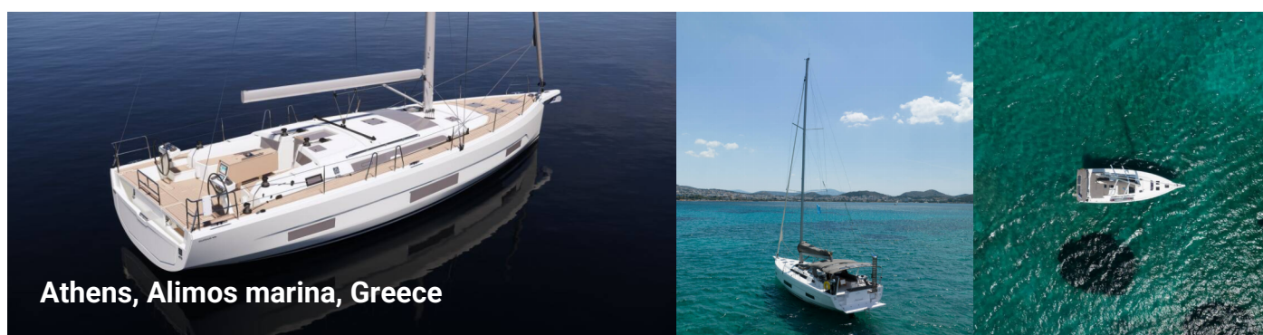
Athens, Alimos marina, Greece