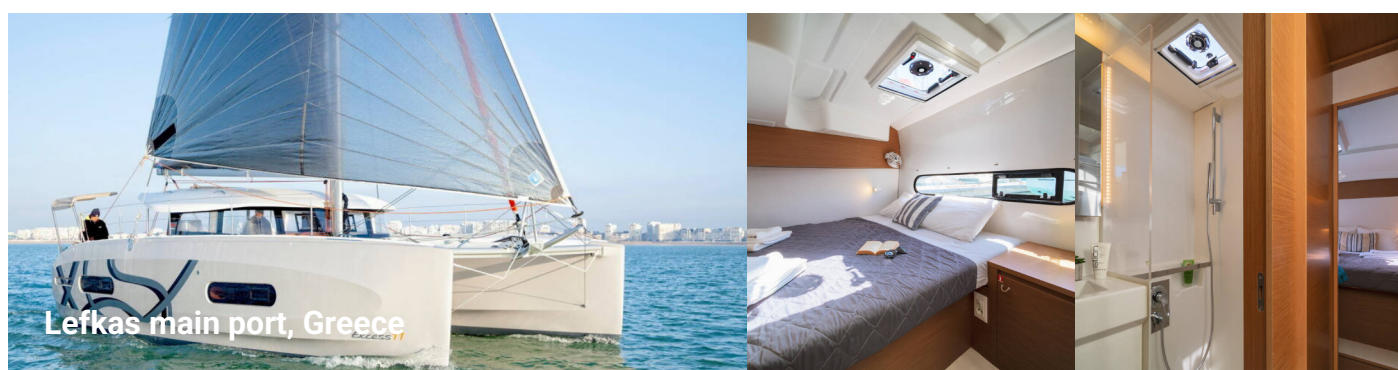
Lefkas main port, Greece