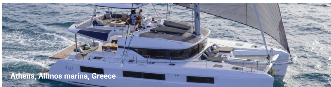
Athens, Alimos marina, Greece