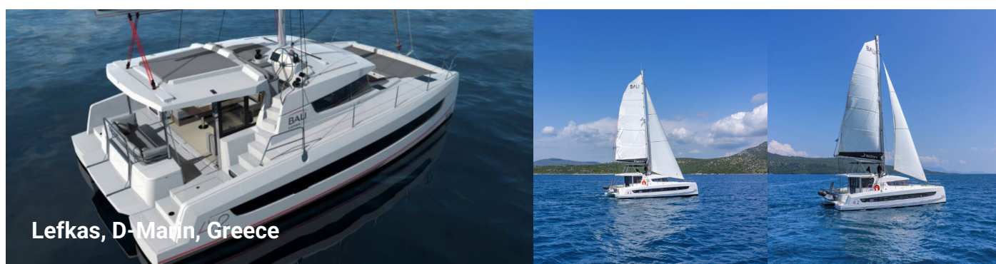
Lefkas, D-Marin, Greece