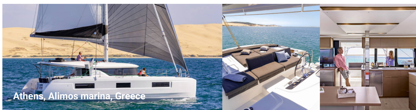
Athens, Alimos marina, Greece