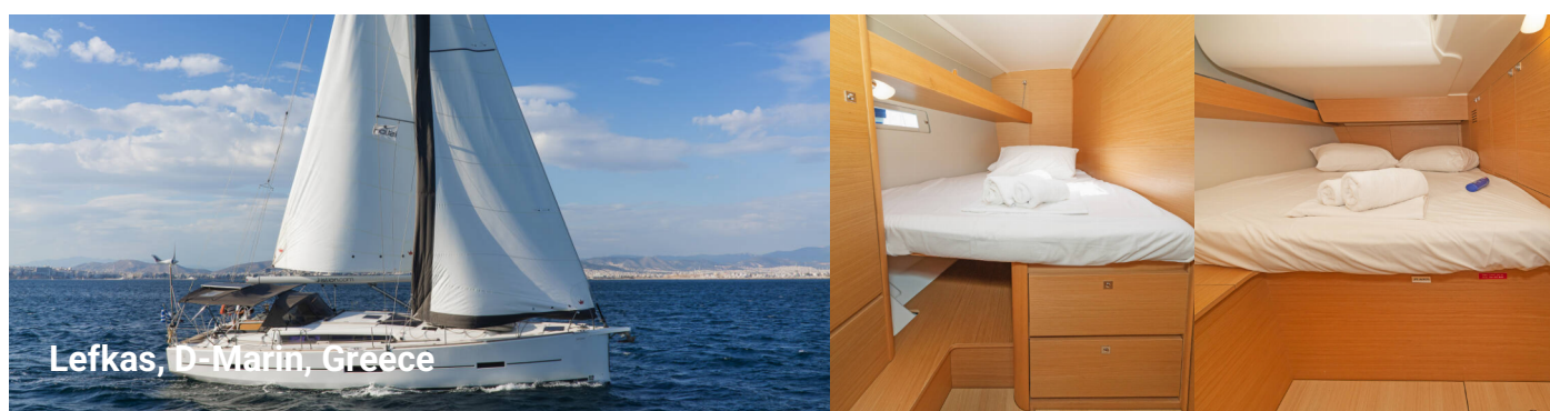
Lefkas, D-Marin, Greece