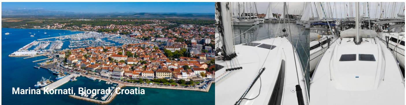
Marina Kornati, Biograd Croatia