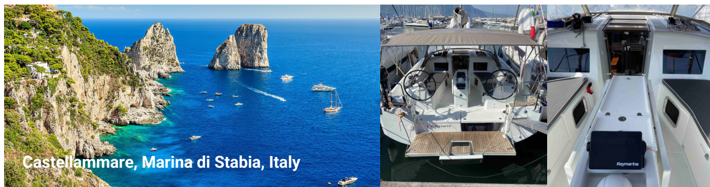
Castellammare, Marina di Stabia, Italy