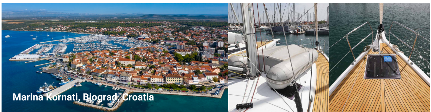
Marina Kornati, Biograd, Croatia