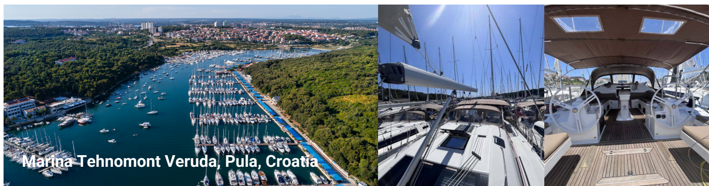
Marina Tehnomont Veruda, Pula, Croatia