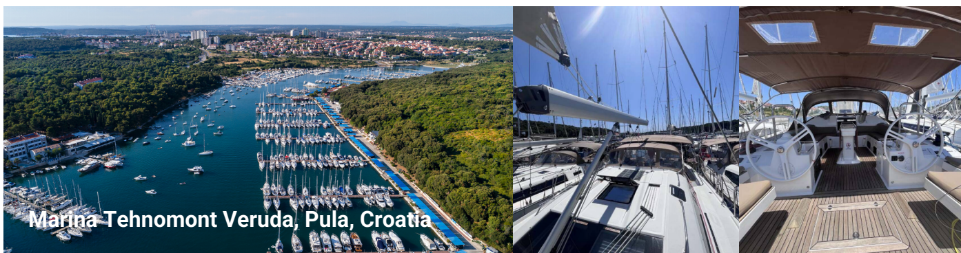
Marina Tehnomont Veruda, Pula, Croatia