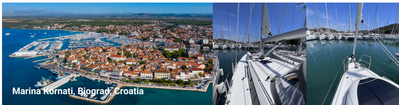
Marina Kornati, Biograd, Croatia