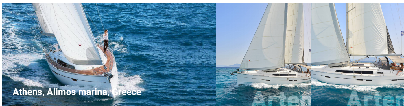
Athens, Alimos marina, Greece