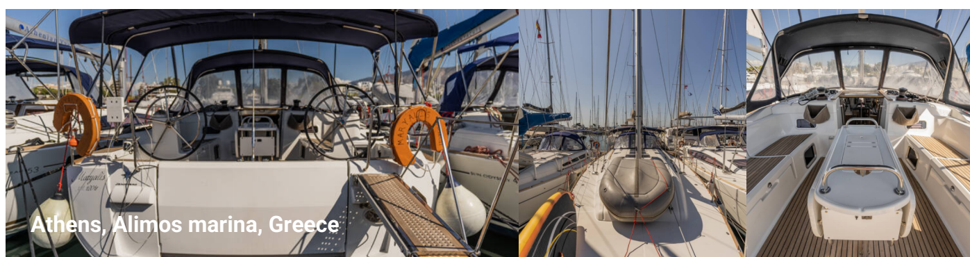
Athens, Alimos marina, Greece