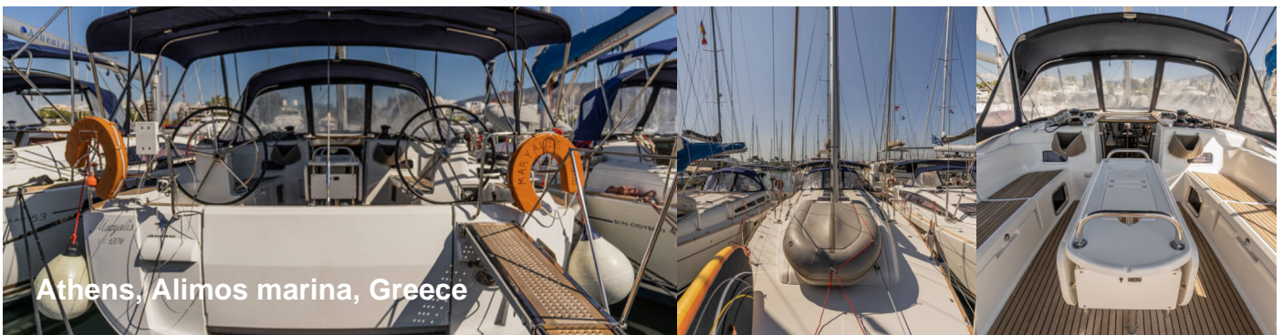
Athens, Alimos marina, Greece