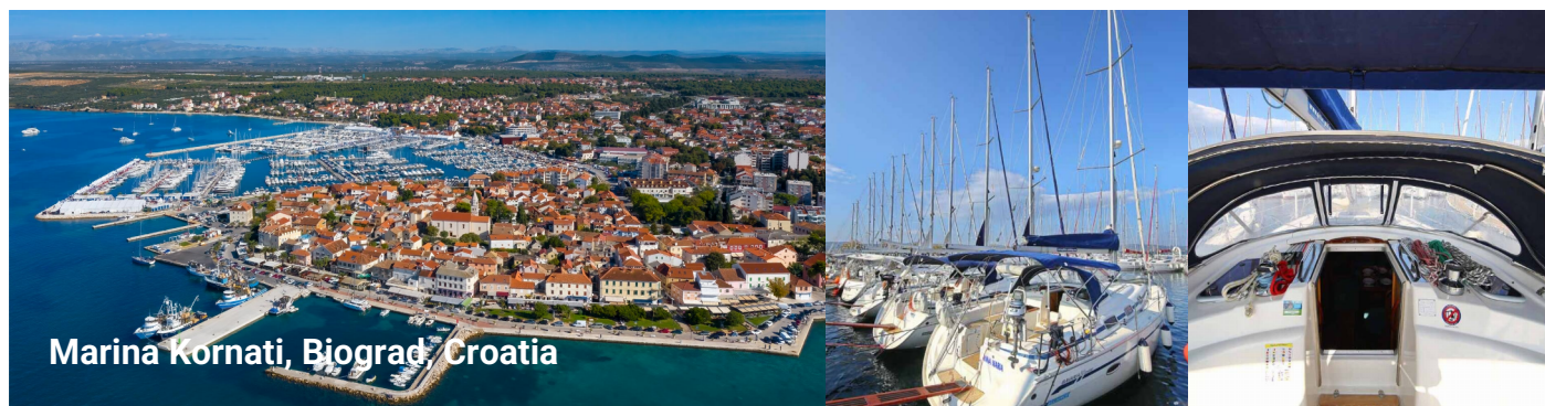
Marina Kornati, Biograd, Croatia