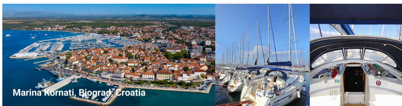
Marina Kornati, Biograd, Croatia