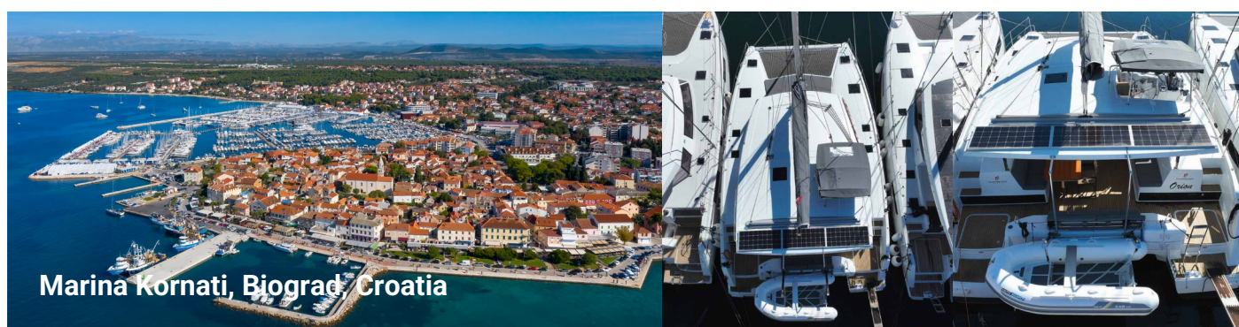
Marina Kornati, Biograd Croatia