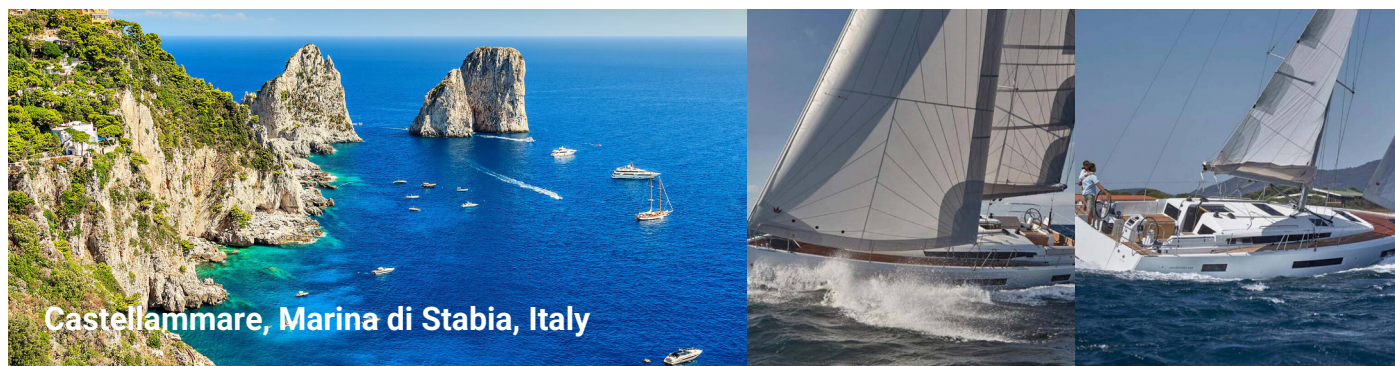
Castellammare, Marina di Stabia, Italy