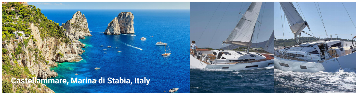
Castellammare, Marina di Stabia, Italy