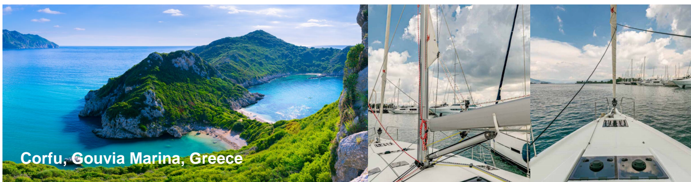
Corfu, Gouvia Marina, Greece