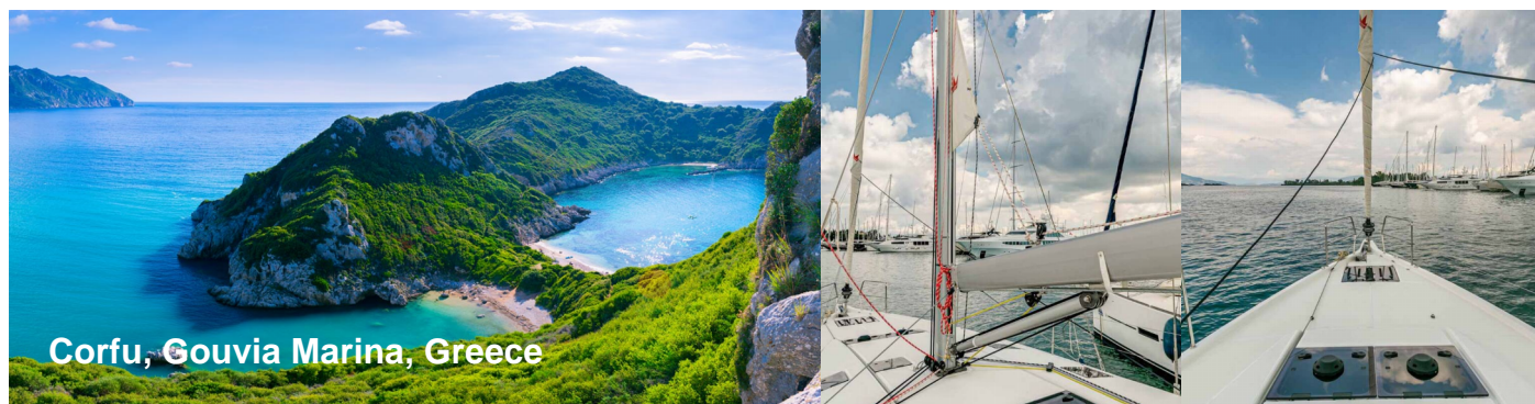
Corfu, Gouvia Marina, Greece