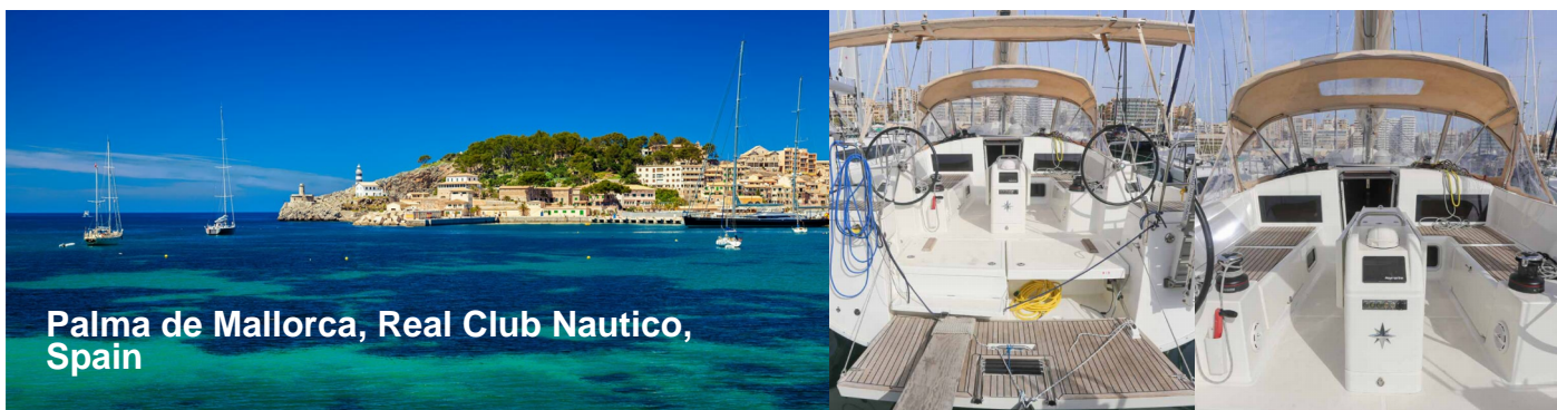
Palma de Mallorca, Real Club Nautico, Spain