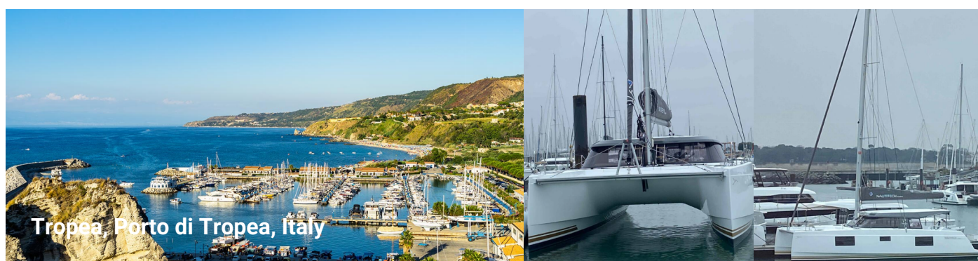
Tropea, Porto di Tropea, Italy