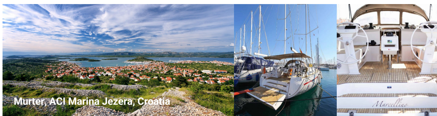
Murter, ACI Marina Jezera, Croatia