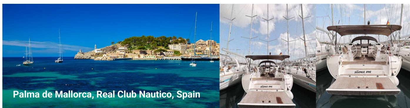
Palma de Mallorca, Real Club Nautico, Spain