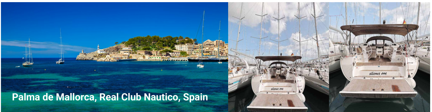
Palma de Mallorca, Real Club Nautico, Spain