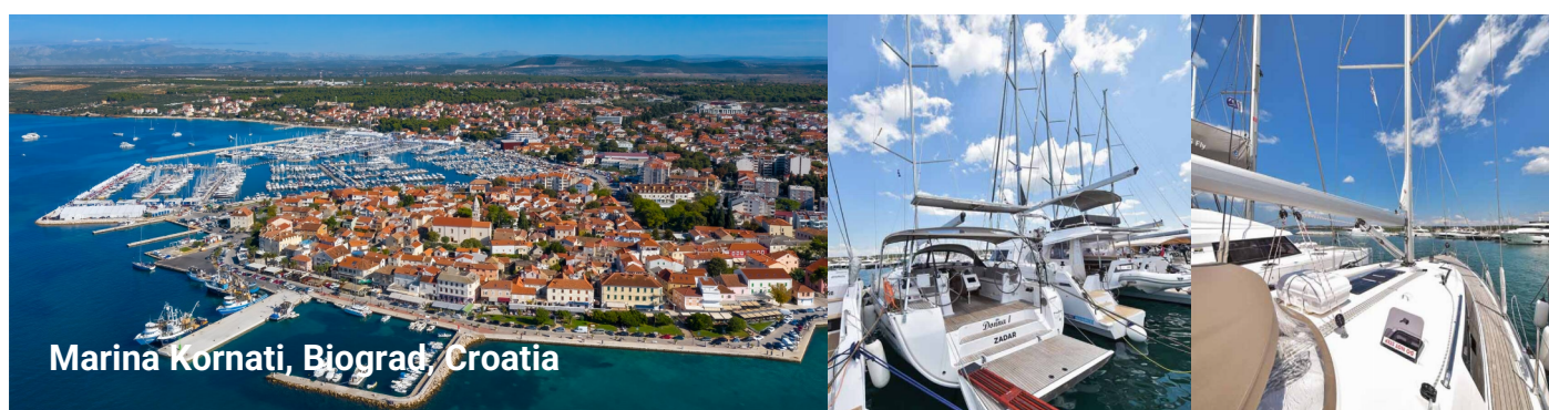
Marina Kornati, Biograd, Croatia