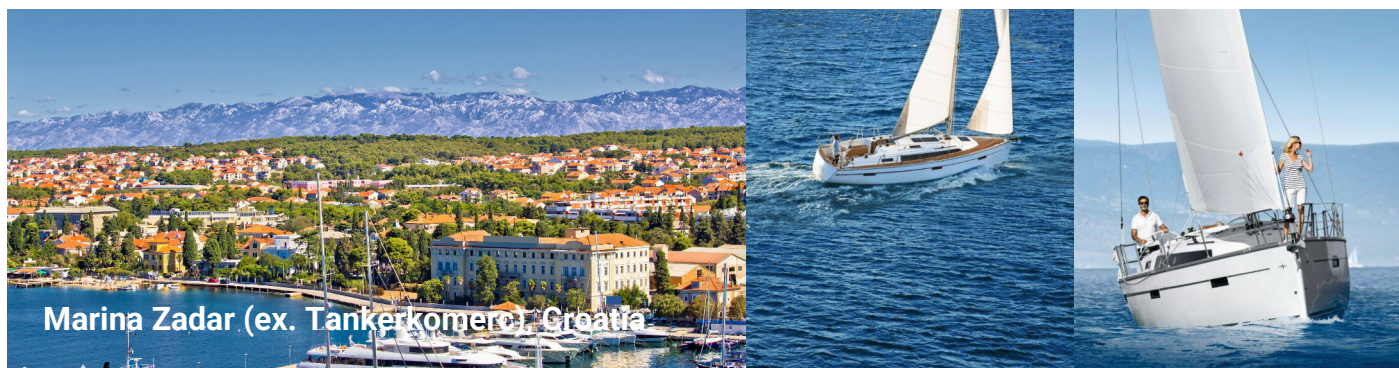
Marina Zadar (ex. Tankerkomerc) Croatia