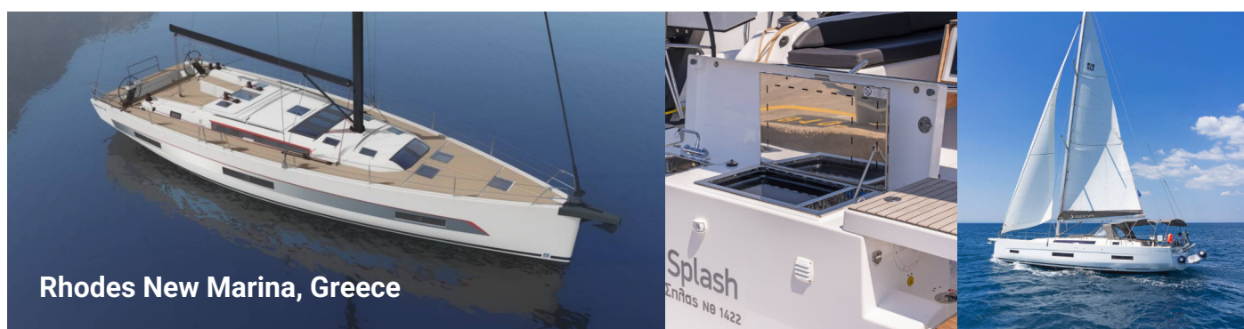
Rhodes New Marina, Greece